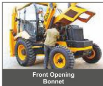
Front Opening Bonnet