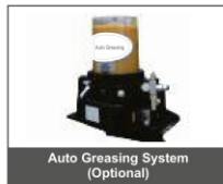
Auto Greasing System (Optional)