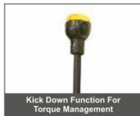
Kick Down Function For Torque Management