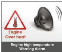
Engine Over heat