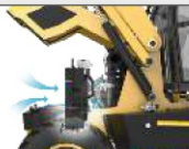
AKG (German) Radiator Cooler