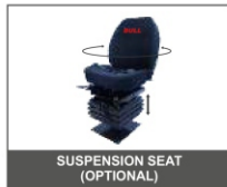
SUSPENSION SEAT (OPTIONAL)