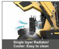
Single layer Radiator/ Cooler: Easy to clean