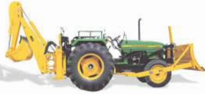
Backhoe Dozer Attachment