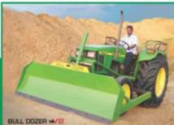
BULL DOZER V2