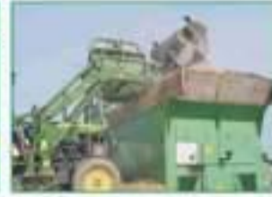
Material handling at Batching plant