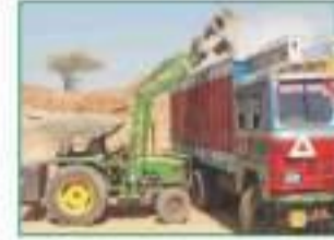
High Dumping @ 13.12Ft Tallest Loader in India