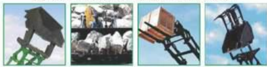
Booster Bucket Stone Bucket Fork lift Grabbing Fork