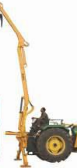
Radial Loader Attachment